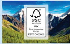
Photographic background with exclusion zone faded out