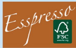
In combination with other brands